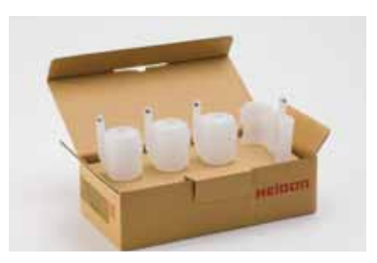
Applications BL Series, BLh Series, BL-R Series, Ft Series, Z+ Series, BLh-R Series