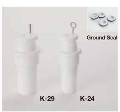
Type:K24 Applications/TS24 Type:K29 Applications/TS29 Grand Seal (Repair parts)