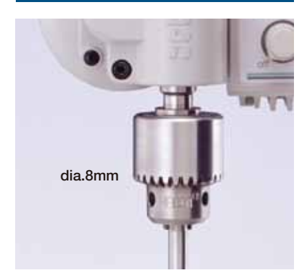
Applications BL Series, BLh Series, BL-R Series, Ft Series, Z+ Series, BLh-R Series