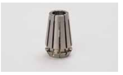
Type:CC-2 (dia.2mm) Type:CC-6 (dia.6mm) Type:CC-4 (dia.4mm) Type:CC-8 (dia.8mm)