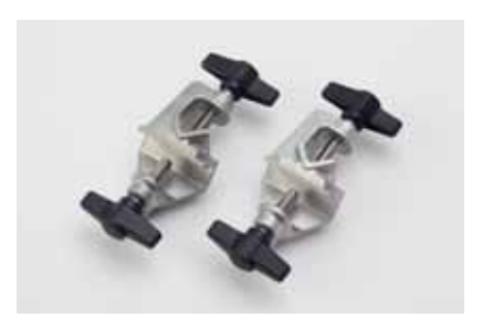
Applications BL Series, BLh Series, BL-R Series, Ft Series, Z+ Series, BLh-R Series, BLW Series