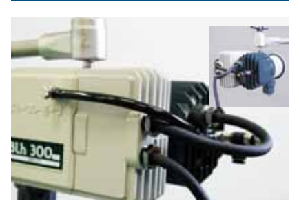
Applications BL Series, BLh Series, Te Series, Ft Series, Z+ Series